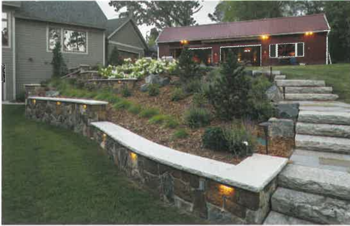
Detail shot. We re-used the concrete steps that run along the edge of the wall and added bluestone landings, making it easier to climb the steps.