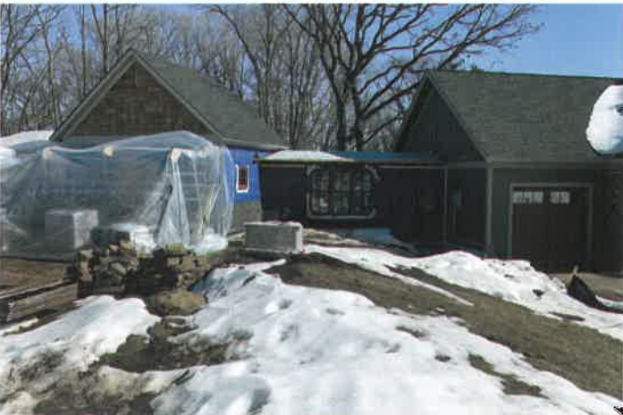
Progress: The home and pool house are connected by an enclosed hallway. This satisfies code requirements that state a property can only have two outbuildings.