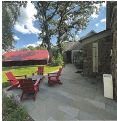
An outdoor shower is nestled into the corner along the breezeway. The shower drains to the rain garden on the northeast corner of the property. The rain garden was installed to collect runoff from the additional square footage of the pool house and pool deck.