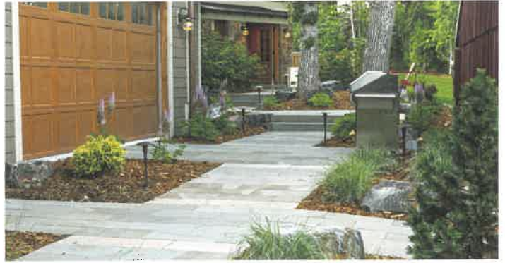
AFTER: Connecting the pool area and the backyard was accomplished with a breezeway. Trees had to be cleared but we kept the larger ones to maintain a portion of the wooded area. Bluestone walkways illuminated by path lights connect the backyard patios and game house with the pool area. The garage door to the left opens to the driveway.