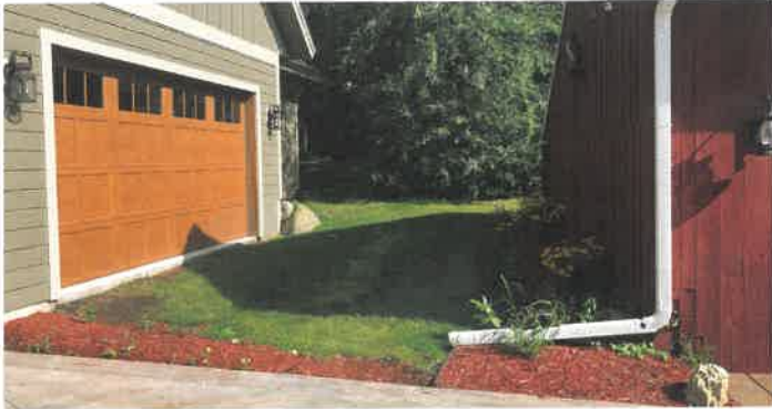
BEFORE: With the pool now located on the north side of the driveway, the next challenge was connecting the pool area to the rest of the backyard.