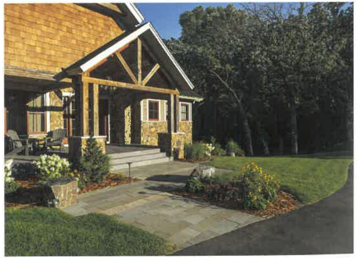
AFTER: Bluestone walkway with seat boulders cut into the corners. The bluestone matches the pool deck and breezeway. Smaller beds and fewer plants across the front. Mulch is a nod to the cedar shakes above the front door. Night lighting "extends" the front entry to the driveway.