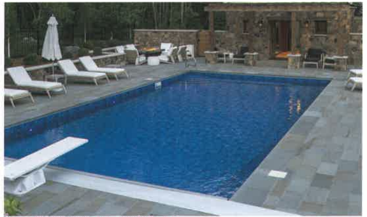
The new challenge was the pool house. The city permitted a maximum of two outbuildings — the existing Red Barn and the storage building meant that a free-standing pool house was not an option. The solution? Connect the pool house to the home with an enclosed hallway. The pool house has a bathroom, two refrigerators, an indoor shower, an outdoor shower, washer/dryer, and storage for poolside furniture, pillows, towels, and toys.