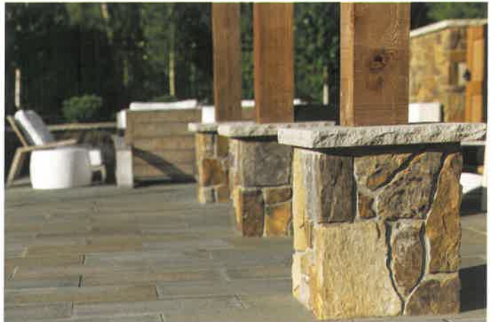
We used Moss Rock stone for the walls, columns & pool house. This is the same stone used on the exterior of the house and walls.