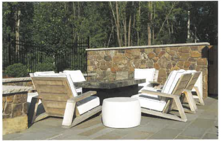
The second fire table is on the pool deck. Behind the wall above, you'll find the pool equipment. There's a gate on the far side for easy access when maintenance is necessary.