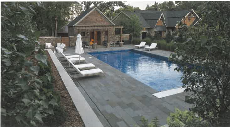
Cedar shakes on the gable pool house roof match the front of the garage and home. Though we faced a handful of project challenges, we were able to fulfill all of the client's wish list items. Minnesota summers just got a whole lot better for this family!