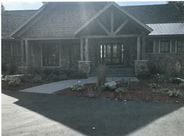
BEFORE: Front entry had random boulders and plants with a concrete sidewalk. None of it matched the style of the home. The oversized beds did nothing to enhance the front entry.