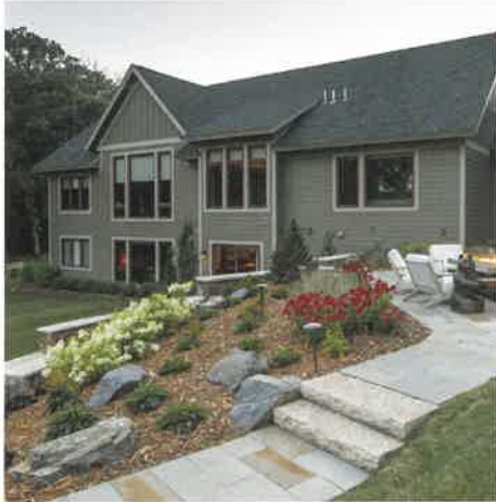
The landscape hugs the home and the outdoor living spaces are connected. Even if you are inside the house, you can see everything going on. The small door leads to the main floor of the home.