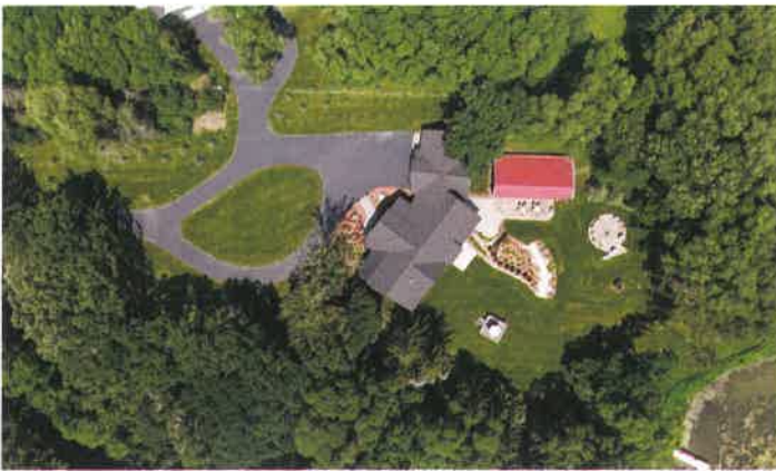
BEFORE: This aerial before image shows how the spaces were disconnected and scattered throughout the yard.