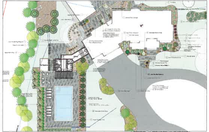
A detailed design plan is required for project entries.