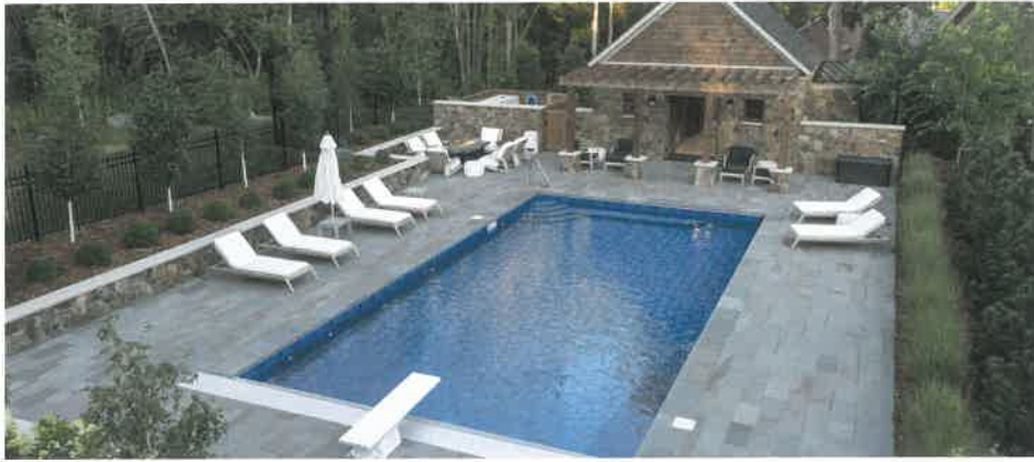
The evergreens and grasses along the pool deck on the right separate the pool area from the driveway, provide privacy, and block the view of cars during a party.