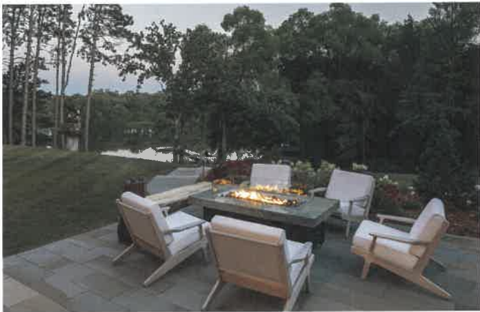
There are two fire tables on the property. The space above is located off the red barn in the backyard. It overlooks the lake.